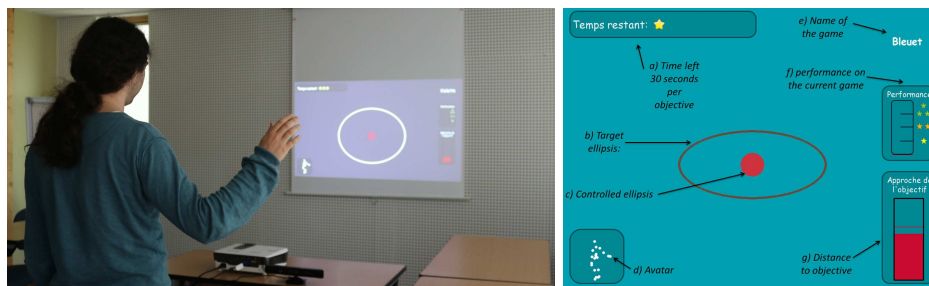
Fig. 1. a) Subjects are exploring how to control an ellipsis displayed on the screen in front of them by moving their body joints tracked by a Kinect device. b) Details of the interface shown to the user on a screen in front of them: in particular, you can see the controlled ellipsis (in red) and the target one (in brown).

This experimental setup is designed as a game setting human subjects into an intrinsically motivated activity [11]. Participants can freely explore and shift between several games, each being about finding a mapping between their movements (body joints