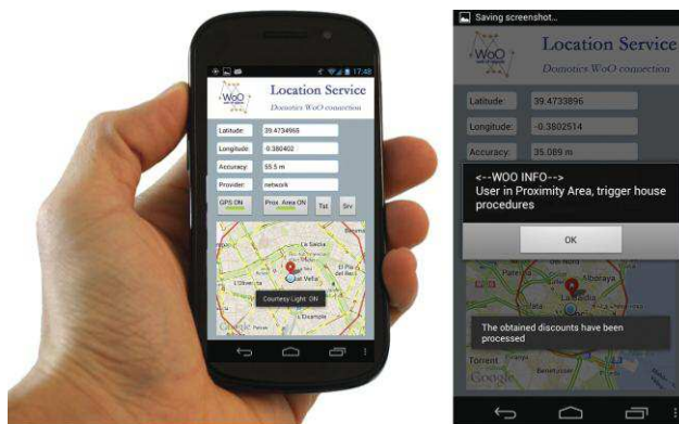
Figure 2: GNSS location-based automatic house entities requests

The results to date are very promising: we integrated the previous smart objects with many partners in order to compose an Open Smart Neighbourhood ecosystem on top of the Web of Objects platform. This allowed us to deploy and test some recent research results in projects related with the Internet of Things, Machine to Machine communication (M2M) and Ambient Intelligence systems development. We have acquired insight into the use of smart WoO objects such as mobile devices, user