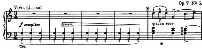
FIGURE 1. Music score of the Mazurka Op. 7 No. 5 by F. Chopin. It begins with a long sequence of repeated events, i.e. states with identical observation probabilities.

Our definition of time-coherency emerges from the following fact: music scores might be composed of very long sequences of “repeated events” such that the one in figure 1. What would happen if all states j \in E share the same observation probabilities? We call non-discriminative observation such a model where b_1 = b_2 = \dots \stackrel{\text{def}}{=} b . Note that this assumption may model other realistic situations of Bayesian inference such as missing observations [8].