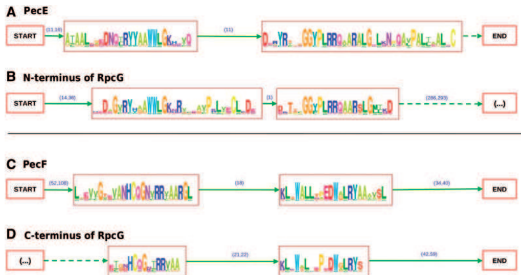
Figure 2. Example of motifs created by Protomata learner for members of the E/F subclass 1. Motifs for the PecE (A) and PecF (C) subunits of the PCB:Cys-84 \alpha -PEC lyase-isomerase PecE/F(12) and for the corresponding N-terminus (B) and C-terminus (D) of the closely related fusion protein RpcG, a PEB:Cys-84 \alpha -PC lyase-isomerase (9). Note the similarity of motifs independently found by Protomata learner for these two sets of protein sequences, and in particular the presence of the well-conserved motifs YyaAWWL, biochemically characterized as essential for the lyase activity of PecE (13) and nHCQGn, conferring its isomerase activity to PecF (13), in the N- and C-terminus of RpcG, respectively.

The ‘Pigmentation’ page displays the PBP content for each strain listed in the genome page and the chromophores found at the different binding sites of PBP subunits. The latter information was either determined biochemically (bold letters) or predicted by CyanoLyase authors (normal letters), based on the presence of specific phycobilin lyases in the genome.