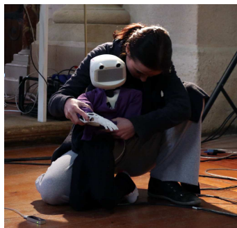
(b) Physical interaction