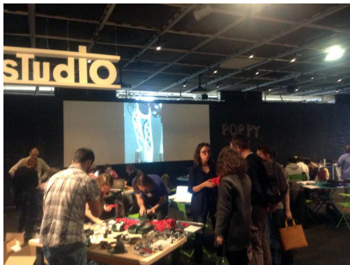
(a) Universcience hackathon in progress

In two days, this group of new users, self-trained using online documentation have been able to build from scratch the whole robot and make it move using the Pypot library. They even designed a new original semi-passive solution for the ankle joint, as well as a robot helmet which was 3D printed and assembled within the time of the workshop. This experiment did not only show that the platform was easily usable in an educational context with users of all ages, and was rebuildable in two days by a little group, but it also showed high educational value as testified by users and educators (see https://forum.poppy-project.org/t/poppy-project-at-la-cite-des-sciences-et-de-lindustrie/ )