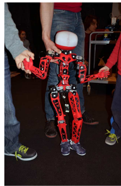
(b) Poppy fully-assembled