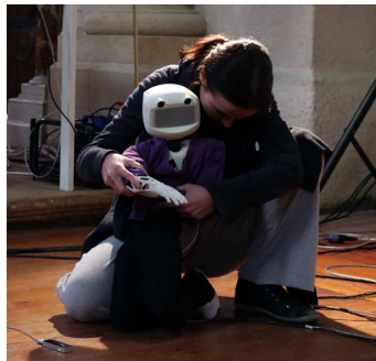
(b) Physical interaction