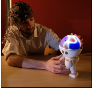
Fig. 4. Left: the Mind Mirror, Right: Teegi, two new real-time visualization tools of the user's own brain activity, based on augmented reality.

1) Mind-Mirror: The Mind-Mirror enables its users to visualize their own brain activity in real-time, in their own head [22]. It uses augmented reality and head-tracking to overlay a representation of an active brain on top of the user's head, seen in a semi-reflective screen (see Figure 4, left). This gives the illusion that the user can see his/her own brain in his head, in a mirror, in activity, the EEG power from different channels being represented in real-time on the surface of the brain. The Mind-Mirror was tested as a feedback to train users to control an attention-based BCI in which the user had to perform concentration or relaxation tasks to control two different commands. The Mind-Mirror was compared to a classical gauge feedback for the same task. Results showed that users found the Mind-Mirror to be indeed an engaging and innovative visualization tool. In terms of performance however, it was not better than the classical gauge feedback. This suggests that selecting and visually enhancing the relevant information is probably necessary to ease the user perception and understanding of his/her own brain activity.