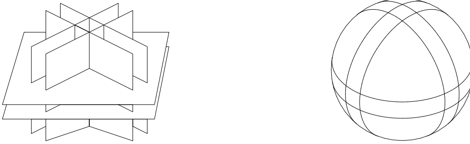
Fig. 2: The non-central arrangement x, y, z = 0, 1 and its associated spherical subdivision.

Let \mathcal{H} be a non-central hyperplane arrangement in \mathbb{R}^n with intersection lattice \mathcal{L} . Let \mathcal{L}_{ub} denote the unbounded intersection lattice , that is, the subposet of the intersection lattice consisting of all affine subspaces with the points (dimension zero affine subspaces) omitted. Similarly, let T_{ub} denote all of the faces in the hyperplane arrangement \mathcal{H} which are unbounded. We observe that T_{ub} is the face poset of an (n - 1) -dimensional sphere. Pick R large enough so that all of the bounded faces are strictly inside a ball of radius R . Intersect the arrangement \mathcal{H} with a sphere of radius R . The resulting CW-complex has face poset T_{ub} . Our goal is to compute the cd -index of T_{ub} in terms of the ab -index of \mathcal{L}_{ub} .