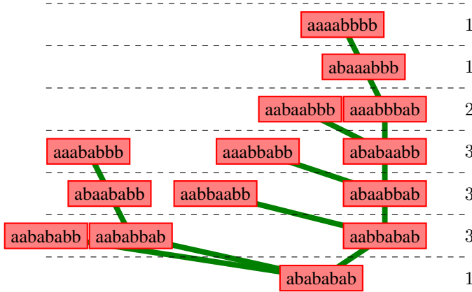
Fig. 4: The tree of Dyck words of size 4 describing the function R .

three toppled vertices to the four untopped vertices different from x_n may be interpreted as those in cells labeled by d in (b) (before toppling) and by cells on (c) labeled by i (after toppling). The configuration w is sorted to get w' = (6, 4, 4, 3, 1, 0, 0, s - 4) described in part (d), and this sorting may be interpreted as taking a conjugate of the word d(u) . This sorting operation may also be described by the exchange of f and g in the rewriting of afbg into gabf . In this example we have d(u) = afbg with f = aabbab and g = aababb giving gabf = aababb.ab.aabbab = d(w') .