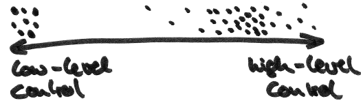
Figure 1: Existing NPAR tools in the interaction spectrum.

low-level control is desired, the technique could also allow artists or illustrators to adjust the result in high detail, down to the individual marks. Some researchers have attempted to support such large-scale to detailed adjustment in the past, for example Deussen/Hiller et al. [DHvOS00, HHD03] with their brush-based adjustment of stippling. Yet, a professional artist would probably prefer to be able to explicitly draw marks like with traditional pens, instead of using brushes that stochastically place new dots somewhere within their scope—even if that is very small.