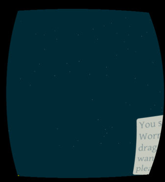
Figure 6: Besides text, graphical elements are kept minimal. The environment serves purposes, e.g. to give a sense of time or a sense of orientation.