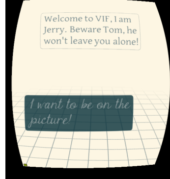
Figure 8: Events can occur depending on what players see and on texts' position, resulting in emerging game mechanisms that are physically involving.

Welcome to VIF, I am Jerry. Beware Tom, he won't leave you alone!