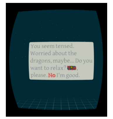
Figure 5: Users can interact with text elements in a more traditional way, using their gaze.

On the other hand, physiological computing is mature enough to asses mental states and emotions [3]. In particular, mobile brain imaging techniques alike electroencephalography (EEG) can be employed to measure a variety of constructs such as workload or attention; cognitive processes that were harder to monitor in the past [4]. Physiological sensors are not restricted to the laboratory, nowadays they can be used the field through carefully crafted wearables, e.g. [5]. These technologies make computers comprehend users [11].