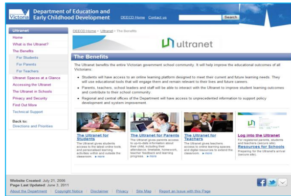
Fig. 18. The Victorian Education Ultranet http://www.education.vic.gov.au/about/directions/ultranet/benefits/default.htm

The idea is that, using the Ultranet, teachers will be able to create curriculum plans, collaborate with other teachers, monitor student progress and provide assessment. The Ultranet will also assist parents in gaining benefits of flexible access to student information and school resources that will help them keep up-to-date with their child's learning. This dynamic student profile will include attendance records, test results, timetables, learning progress, homework activities, tasks, and feedback so providing a way for parents to support their child. These features should strengthen and extend parental involvement in schools and will result in richer more holistic and better negotiated approaches to student learning.