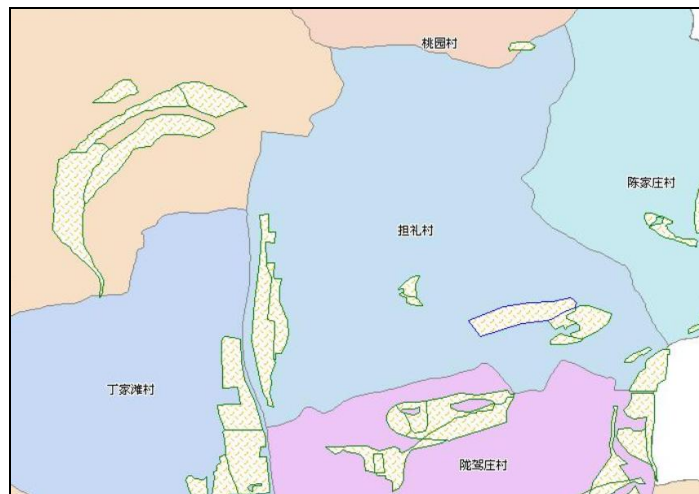
Fig. 3. Chart of traceability result—information of field parcel

According to the traceable code, the system shall directly illustrate the concrete position of the field parcel of the fruit, and also information such as the corresponding county name, town name and village name could be found. As illustrated in Fig. 3, consumers could learn that the field parcel is in the Danli village, Miaofengshan town of Mentougou District, Beijing. When the user clicks the field parcel on the map, information such as planting personnel, water, air, soil nutrient, fertilizer use, pesticide delivery and product inspection could be queried.