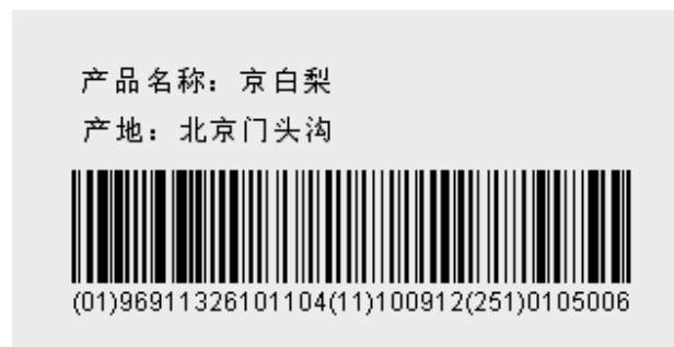
Fig. 2. Traceable label of fruit

The traceable label also includes the goods name, producing area and other information consumers concerned in form of the text besides the traceable code.