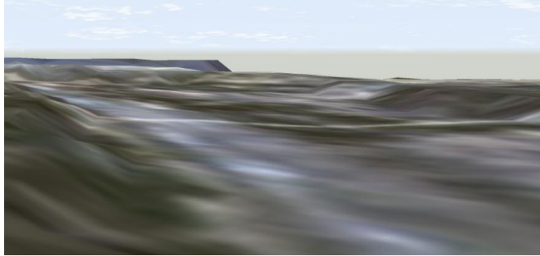
Fig.3.Wandering rendering in Fuxin Haizhou dump

During the wandering in the equipment deploy scene in land reclamation area of mining dump, viewpoint firstly contact with the ground, at the same time ,collision detection occurs. When the viewpoint come into the deployed equipment, t collision detection occurs between the viewpoint and the equipment. Consequently the viewpoint can't go on wandering unless its changes its direction.