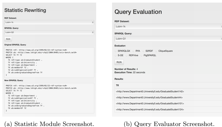
Fig. 2: Screenshots.

by evaluating several SPARQL queries on various RDF datasets: such as those presented in Table 1 and other smaller ones. Additionally, we also deploy the other HDFS-based distributed systems (to have a common basis of comparison); thereby, participants can compare several systems running exactly on the same cluster. We demonstrate SPARQLGX and SDE with various interaction scenarios: