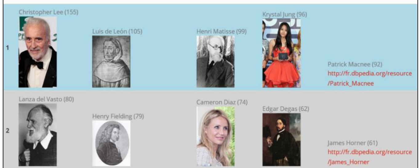
Fig. 3. Crossing DBpedia artist category with edition history data

06/2014 << 05/2015 << 06/2015 >> 07/2015 >> 06/2016