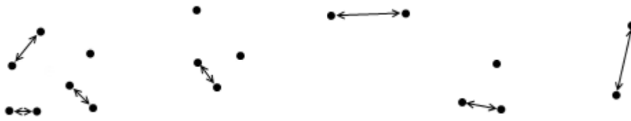
Fig. 2. Pairs of Nearest Neighbors according to “Relative Minimal Distances” distance metric

In addition to the above description, the distance between two objects in a search space is considered to be minimal, if and only if each of these objects is nearest to the other one (1-1 nearest Neighbors), regardless of the actual distance between them that is measured by any of the existing distance metrics (Fig. 2).