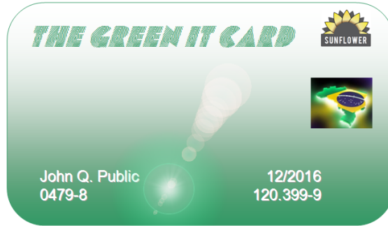
Fig. 2. First design of the Green IT Card.

whose reduction of paper emission occur more slowly begin to credit infotercios later. If equation (2) equals to negative values, this means that institution is still not fully working to credit infotercios in face of its coefficient \eta (Fig. 1. b). So, to credit infotercios , the institution must prove that it operates according to a planning for paper outputs reduction.