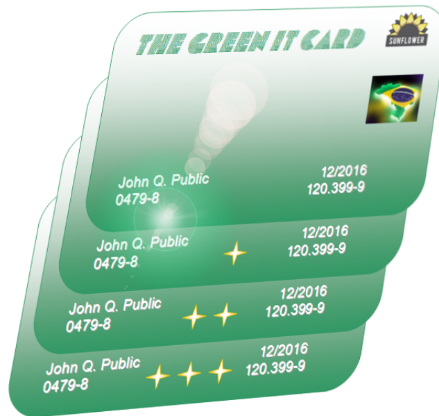
Fig. 3. The four green cards.

2 - two stars; d) level 3 - three stars. This card will be activated whenever the manager take public charges and disabled when targeted for natural exoneration.