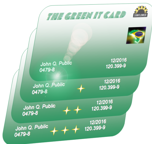
Fig. 3. The four green cards.

2 - two stars; d) level 3 - three stars. This card will be activated whenever the manager take public charges and disabled when targeted for natural exoneration.