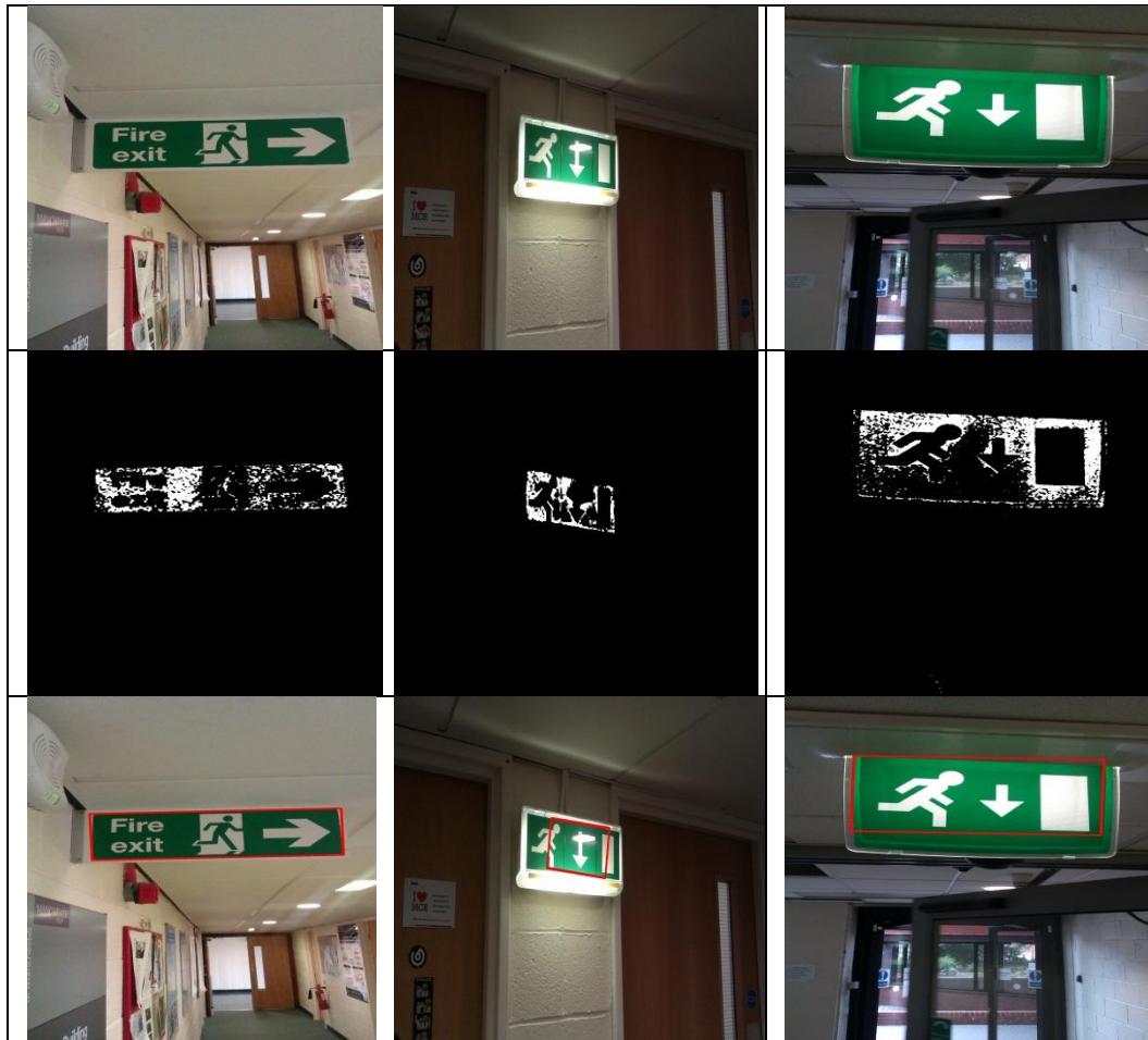
Fig. 3. Row 1: Original Exit sign Image; Row 2: Backprojected Image; Row 3: Tracked region of the exit image.