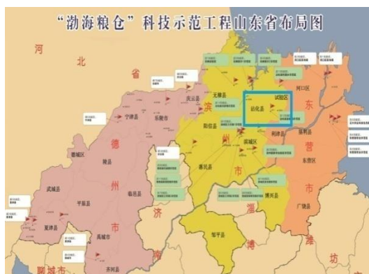
Fig.1. Experimental area location

Experimental area is in Shandong "Bohai granary demonstrative project of science and technology" in the project, the area contains Dezhou, Binzhou and Dongying district, 115°45'-119°10' east longitude, 36°24'-38°10' north latitude, a total of 30 counties (city or area), and grain land is 15 million mu, the cotton fields transformed to grain is 1 million mu, the land of sanlinization is 1 million mu. Are shown in figure 1 in the blue box. The layout of ground sensor acquisition node is shown in figure 2.