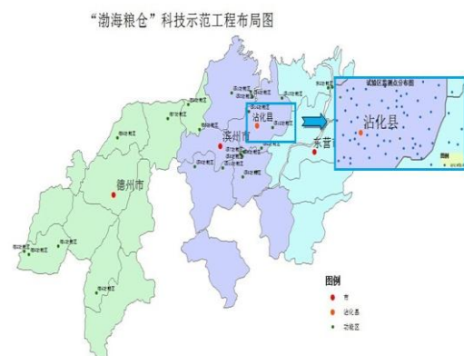
Fig.2. Acquisition node distribution