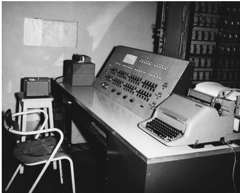
Fig. 1: The only surviving photo of the Manual Control Panel of the 1957 MR.

A detailed discussion of the problems faced by HMR in the rebuilding of the MR is in [8], while in [18] the use of the simulator of the 1956 MR for the “restoration” of its system software is presented. In the following we focus on the use of the 1957 MR simulator in the teaching workshops held at the Museum. The virtual MR is used to revive the look and feel of an old computer and to show and discuss some of the principles and mechanisms according to which past and present computers work.