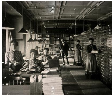
Figure 3: The Universal Bibliographic Repertory, Brussels, 1910

Paul Otlet, who is recognised as the father of documentation, was the first to conceptualise and devise a classification tool which digitised access to knowledge. Considering the notion of information as independent from its medium but also the need to come up with powerful means of transmitting this information, he created blueprints for many systems between 1900 and 1935, each more visionary than the next. As a result, Paul Otlet left us with many drawings and descriptive notes of what technology would become a century later: the video conference, the conference call,