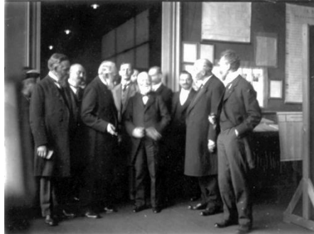
Figure 5: Andrew Carnegie's visit to the "Palais mondial", Cinquantenaire, Brussels, 1913

The Mundaneum, birthplace of international institutions dedicated to knowledge and brotherhood, became a universal documentation centre over the course of the 20 th century. Its collections, comprising thousands of books, newspapers, small documents, posters, glass plates, postcards, and bibliographic records were gathered and stored in different locations around Brussels, including the Palais du Cinquantenaire, built in 1880 to celebrate the 50 th anniversary of Belgium's independence.