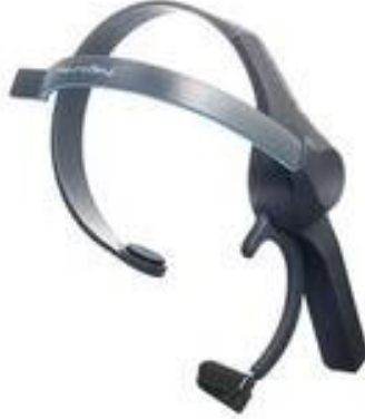
Fig. 2. The simple electroencephalograph MindWave Mobile used for collecting brain wave data. The picture was downloaded from http://mindwavemobile.neurosky.com/ in May 2015.