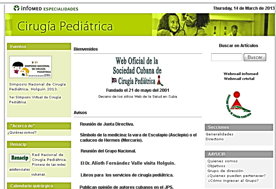
Figure 3. The RENACIP Portal at http://www.sld.cu/sitios/renacip/ (accessed 15-3-2013)