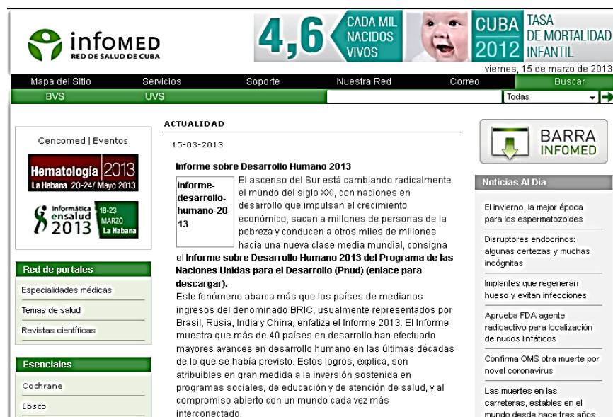
Figure 2. The INFOMED Portal at http://www.sld.cu/ (accessed 15-3-2013)