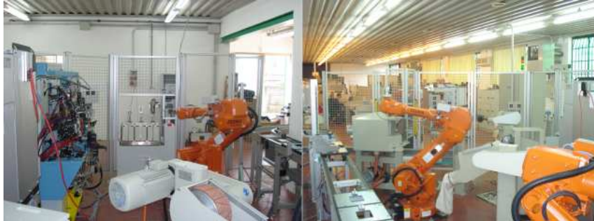
Fig. 2. Overall views of robotic cell A (left) and of robotic cell B (right)

In the robotic cell A, first some manual operations are performed: a human operator picks the semi-assembled shoe from its trolley and puts it in a conditioning unit (nr. 8); after that operation, the operator places the last in front of an RFID station for the automatic setup of the toe lasting machine (nr. 9), performs the toe lasting operation, and then places the last in the man-robot exchange station (nr. 11), which is also a conditioning unit. Then, a manipulator is used to pick the last from the man-robot exchange station, place the chip of the last in front of a second RFID station for the automatic setup of the heel seat and side lasting machine (nr. 13), load and unload that machine, and finally place the last in the pallet conveyor.