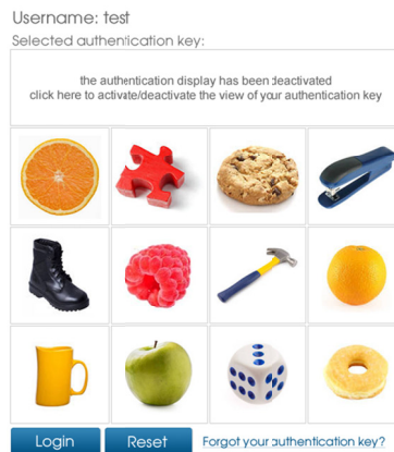
Fig. 2. Graphical authentication mechanism used in the study.

The text-based password mechanism involved alphanumeric and special keyboard characters which could be chosen by the user. A minimum of eight characters including numbers, a mixture of lower- and upper-case letters, and special characters were required to be entered by the users. An additional option for resetting the text-based password was available in case the users forgot their authentication key. In that case, users had to enter their username and a hyperlink was sent to their email that led to a Web-page for resetting their text-based password.