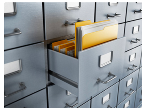
Preparation and Depositing