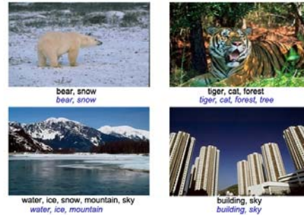
Fig. 2. Some examples of the labeling results