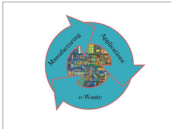
Fig. 2. The ICT life cycle.

Even more impressive is that the number of Internet users reached 2.26 Billion on December 2011 with more than one billion concentrated in Asia [6]. Also, in 2011, the number of networked devices has equalled the world population (7 Billion) and it is estimated to reach more that 14 Billion in 2015 [4].