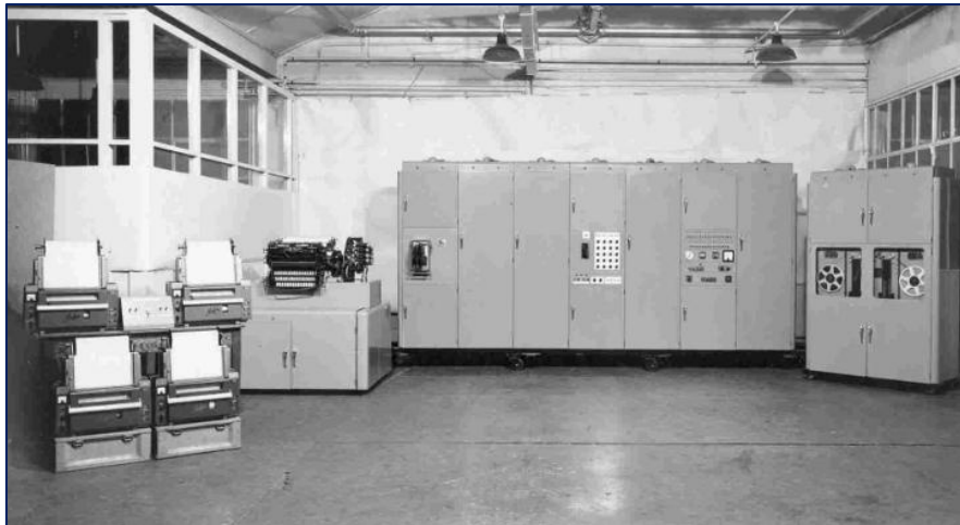
The Elliott 403's Output Converter in the UK in 1955: 4 Mufax plotters, Bull Line printer, Output processor, Magnetic Tape input