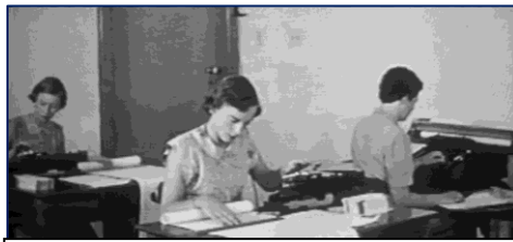
Three “Computers” (from the film “WRE Maths Services”,)

What was done with the recordings from these instruments varied according to the