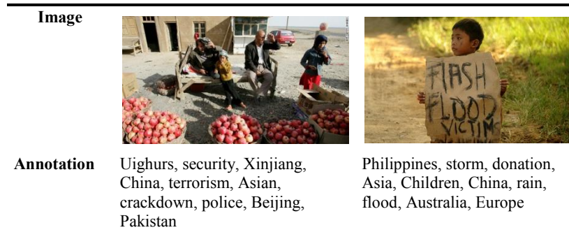
Table 4. Extracted annotation using proposed method

So, we are able to compare t_i and k_j and determine how much they are closed to. Eventually, we can obtain final annotation for given image through proposed process. The following Table 4 the news images and its annotation grasped automatically. The annotations are different from other traditional research that described object in given images. Recognizing an object in images is not cover major meaning of images. The proposed approach in this paper focused on the annotations which describe core meaning of given image. Hence, annotated words are semantically related to titles and images. We believe that this annotation can represent not only documents but also images. However, traditional approaches only can detect object in image so, results will be ‘human,’ ‘apple,’ ‘boy,’ ‘girl,’ and so on for first image in Table 4.