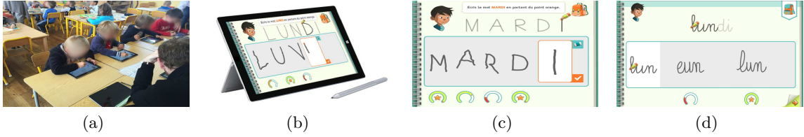
Fig. 1. IntuiScript project overview: First in-class experiment (a), with example of tablet tactile device used (b), and different modules: for Block Letter Writing (c), and for Cursive Writing (d)