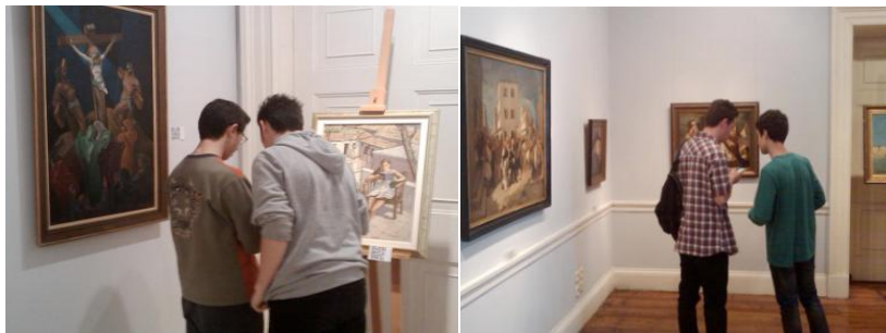
Fig. 3. Students of the mobile-based game were immersed in questions displayed on their mobile phones

The results highlight that the enrolment with the mobile affects their performance. However, both (paper-mobile) games persuade the children in several ways. A team benefits from a strategy and game characteristics seem to motivate and excite them for the activity. In addition, based on the observations of the researcher students seemed to be more focused and immersed on the mobile application (fig. 3). Interestingly, mobile application did not push students to lose their interest for the museum as many paintings and its features are discussed from students by the end of the experiment and on the respective course on school. Another notable observation is that students from both groups spent approximately the same total time at the gallery (19 min on average). This may be derived from students' familiarity with mobile phones and the simple design of the game.