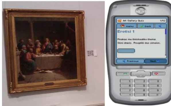
Fig. 2. The QR codes were placed next to the paintings (left), the mobile application (right)