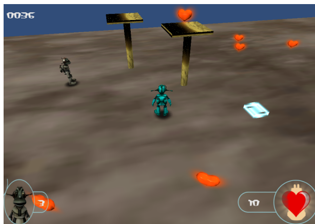
Fig. 1. An example of the game scene

higher platforms not directly reachable by the players. Therefore, they have to use the jumping pads that help a player to jump higher to collect certain items. In order to get on a different island players need to jump across the abyss. If one of the players falls off the island the team loses one life. In all games players have five lives. After a fall, the player reappears at one of the respawn points. A group score is calculated and analyzed to measure the successfulness of the game completion. All closely-coupled games have equal conditions: players need to pick up 75 objects within 7 minutes. Loosely-coupled games are not designed equally and their play conditions are described further individually. The duration of loosely-coupled games is limited to 5 minutes. The game continues until one of the following conditions is met: (1) players collect all required objects; (2) players lose all their lives; (3) the time runs out.