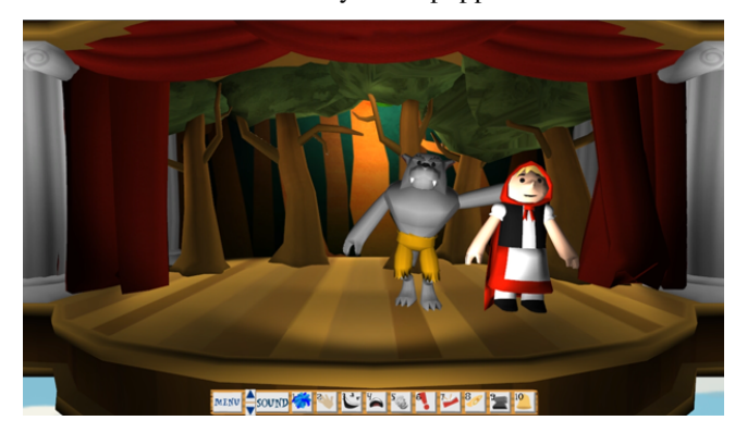
Fig. 1. Stage application at work; lower menu presents stage director options; both puppets are controlled by players.

Puppettime is a digital puppetry project that uses multiple mobile phones as objects to control puppet performances on a projected 3D virtual stage. It is multiplayer, allowing different players to join at any time and participate locally in a shared performance. Once the players have logged on to the central virtual stage, each one can customize their puppets on the mobile devices before they launch them into the performance. During such a performance, each player can either control their puppet with a single device – much like a simple rod puppet – or with two devices that allow for more detailed animation control of body and a puppet limbs.