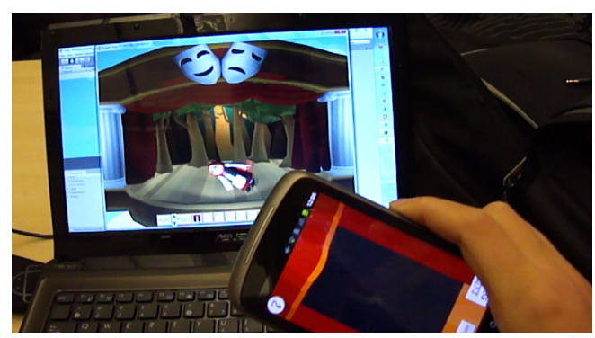
Fig. 3. Single phone control scheme; movements are directly projected onto the puppet body.

The dual phone control adds a second phone that controls either the arms or the head in addition to the main body. The secondary phone provides an interface to allow the user to select which additional limb to control: head, any single arm, or both arms (fig. 2 left). Rotations of this second phone will rotate whichever limb is selected. The access in this case is more complex, since the limbs are restricted to only rotate around a fixed joint, and the arms and head cannot match the orientation of the phone directly because they remain attached to the virtual avatar's main body.