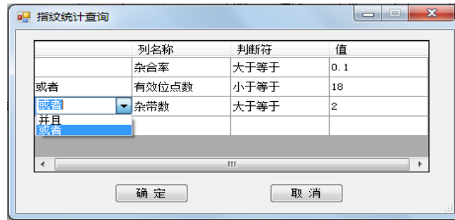
Fig. 2. The SSR fingerprint screening conditions of the inbred lines

Screening can be carried out only after put the SSR fingerprint into database and complete the eigenvalue calculation: the example in this paper screened according to the heterozygous ratio \geq 0.1 or the number of the effective site \leq 18 or the number of mixed band \geq 2 . According to the screening conditions 94 inbred lines were removed (The screening condition interface is shown in(Fig.2):