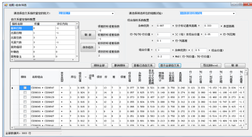
Fig .3. The interface of hybrid combination order

78 inbred lines were got according to the inbred lines SSR data and phenotypic data screening. For each hybrid combination in this paper, it calculated the heterosis rates using formula 2, and calculated the orthogonal value or reciprocal value using formula 6, and calculated the comprehensive value using formula 8, then sorted the hybrid combinations by the comprehensive value (the sorting interface was shown in Figure 3 below).