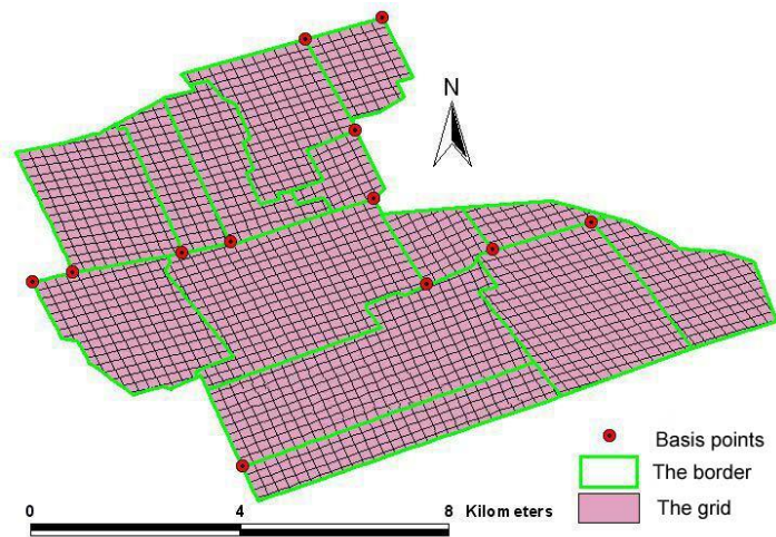
Fig.1 Soil Sampling Point in Nongan town

positioning collecting position of the point. Select the main factor affecting soil fertility [20] (nitrogen, phosphorus, potassium) as the sample data for research, the sampling distribution is as follows: