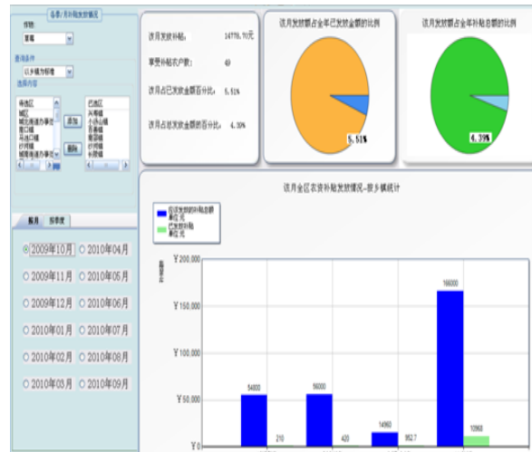
Fig.5 subsidy statistics by month page of the leader subsystem.