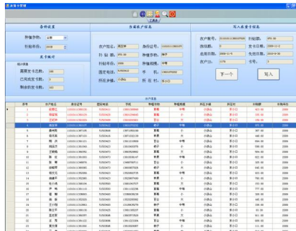
Fig.3 card sending page of the management subsystem.

Management sub-system was comprised of three function modules including the IC card management module, information maintenance module and data query statistics module. It is precisely the information publish and integrate centre of the precision management system for the subsidy of agricultural material, which provides IC card and growing instructions for farmers, recommended agricultural materials and subsidy information for agencies, accurate statistical data of subsidies for the government departments. Fig 3 shows the card distribution interface of management sub-system.