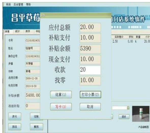
Fig.4 sale page of store subsystem

information of the recommended agricultural materials and related subsidies information from the management subsystem and then transmit to the farmer. Store subsystem distributes subsidies to farmers as soon as they buy the agricultural materials with agricultural subsidies IC card, and then saves the detailed information for each transaction. Every store uploads the transaction data to the central database periodically to summary, aiming to query and stat. Fig 4 is the sale page of store subsystem.