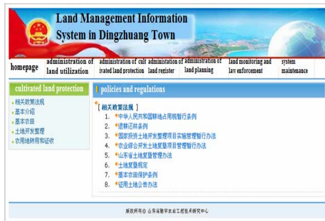
Fig. 3. Farmland protection interface