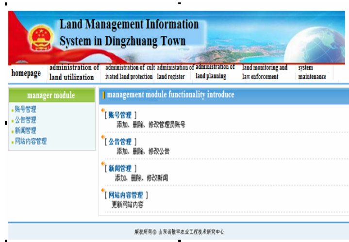
Fig. 5. System maintenance module interface