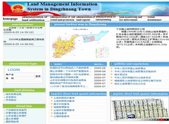
Fig. 2. Host interface of the system

This spatial information inquiry function contains four modules: layer demonstration; Hawkeye; attribute inquiry; inquiry outcome demonstration. In addition, there are other human-friendly functions like enlargement, shrinking, measurement, whole layer demonstration and so on. The first feature is that the users can inquire all kinds of land data information by clicking graphs, such as land plot basic information, land conversion information, basic geographic information and so on. The second feature is that users can inquire spatial graphic information by inputting conditions and also make inquiries by selecting land categories, the administration it belongs to and administrative region.