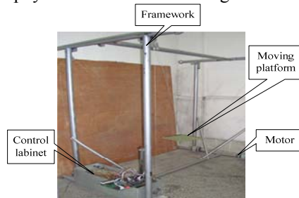
Fig. 3. The material object photography of the designed CMMS

This part attempts to verify the rationality and feasibility of adopting wire-driven PKM as coordinate measuring system through experiments. As some limitations, the designed probe is replaced by some parts in the following experiment. Therefore, checking the probe contacts with the work piece is determined by visual inspection. Besides, the kinematics error of the measuring platform is discussed, it includes the errors of the probe, the distortion of each rope, external conditions and so on. The material object photography of CMM is shown in figure 3.