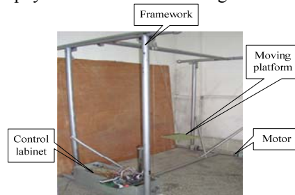
Fig. 3. The material object photography of the designed CMMS

This part attempts to verify the rationality and feasibility of adopting wire-driven PKM as coordinate measuring system through experiments. As some limitations, the designed probe is replaced by some parts in the following experiment. Therefore, checking the probe contacts with the work piece is determined by visual inspection. Besides, the kinematics error of the measuring platform is discussed, it includes the errors of the probe, the distortion of each rope, external conditions and so on. The material object photography of CMM is shown in figure 3.