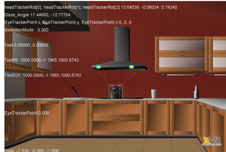
Fig. 4. The frames of the gaze direction bounding box

with the green square. The system can detect when the user is gazing at the green square by testing the collision between the gaze direction bounding box and the green square. In Fig. 4., the frame of the bounding box is displayed and it can be noticed that it intersects one of the objects in the virtual environment, a pot. In this case the bounding box of the selected object is also drawn to confirm the success of the selection procedure.