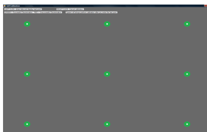
Fig. 1. Calibration screen for a desktop PC

Calibration of the eye tracker used in our experiments, ASL H6-HS-BN 6000 Eye-Track model, an accurate and high speed head mounted system, is typically made on a normal desktop screen Fig. 1., by sequentially gazing at each one of the green points.