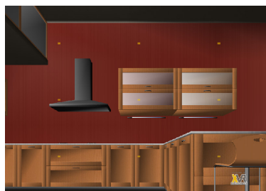
Fig. 2. Calibration points displayed on the powerwall

Our experiments have been conducted on a large projection screen, normally used for visualization of stereoscopic scenes. The nine calibration points were displayed in a similar fashion as on the small desktop screen Fig 2., with respect to the visual field