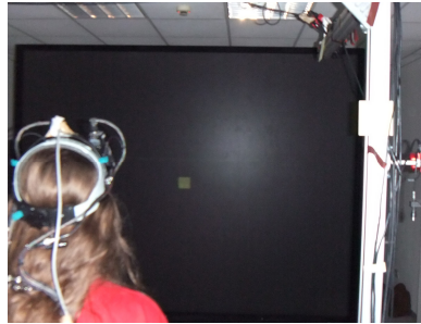
Fig. 3. The green square displayed on the powerwall

The scenario of the tests was very simple; the users had to perform as many selections as possible within 90 seconds. Gaze direction is represented by a bounding box, starting from user's head towards the screen, long and thick enough to collide