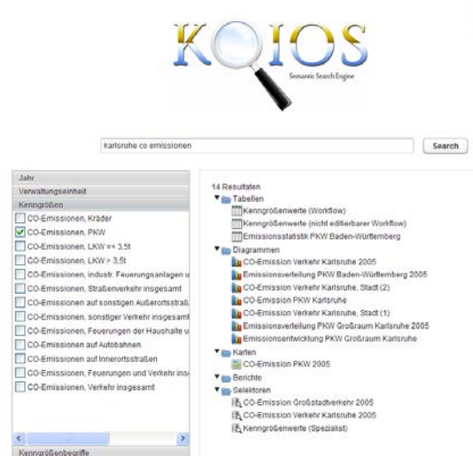
Fig. 2. KOIOS Faceted-Search Interface for Query “Karlsruhe CO Emissionen”.

The KOIOS approach is fundamentally different (see Fig. 2). It applies a so-called schema-agnostic search , which takes a set of keywords and heuristically creates a number of potential SQL-queries which might have been meant by the user when launching his keyword query. These hypotheses are based on the given DB-schema and the statistical distribution of DB-values occurring in the concrete, actual DB-content. Based on that hypothetical SQL-queries, we can then select those Cadenza Selectors which come close to them.