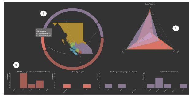
Figure 2: Comparison view: comparing selected hospitals in detail. 1) BC map representation with selected hospitals 2) radar chart of hospital attributes, 3) physicians' name and number of waiting cases

One can click on hospitals in the overview to select these for comparison. This view gives an extra opportunity to compare hospitals and physicians in more detail. It consists of three main components: a map of BC with the selected hospitals to compare, a radar