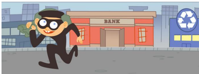
Fig. 5. World Event: Crime Spree (negative).

At the end of the game, a display informs the players of how they did. Summary information about group and individual outcomes is given through graphics and simple text. The game is designed to be played over and over in order to adjust strategies and learn from mistakes. It is possible, but non-trivial to end with a balanced game world. A video of the Futura project is available at http://www.antle.iat.sfu.ca/Futura/ .