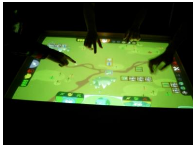
Fig. 1. Sustainability game on our custom tabletop.

There are three distinct roles that players can take: food, shelter, or energy supply. Each role has an individual toolbar oriented to each of the three sides of the table (Figure 2). The goal of the game is to support the population living in the area without having a catastrophically negative effect on the environment. Players must decide what kinds of food, shelter, or energy producing facilities to construct, and attempts to achieve balance in terms of the population support: neither wasting resources nor failing to provide for the population's needs.