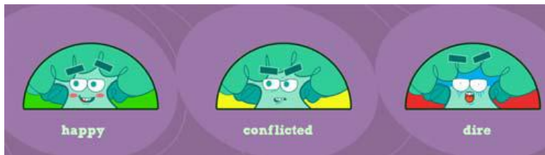
Fig. 4. Tree global environment feedback states (tree colour and facial expression).