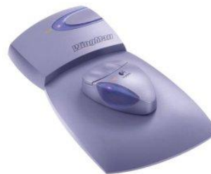
Fig. 2. Logitech Wingman force-feedback mouse [14]

Blind users have the choice of using the keyboard, or using both the keyboard and the Logitech Wingman force-feedback mouse (Figure 2) to interact with the game. The interface contains four different-colored buttons (labeled ‘red,’ ‘blue,’ ‘green’ or ‘orange’) arranged in the shape of a cross. Each button is mapped to an earcon or speech icon, which is presented for a period of 100ms at 60dB using recommendations from [5] (Table 1). The buttons were recreated in the auditory domain using non-speech sound by manipulating the pitch and spatial position of a pure sine tone. Upward movements are indicated by a 1 second sine tone with an upward frequency glissando (220Hz-880Hz) and a sine tone with a downward glissando indicates a downward movement (880Hz-220Hz). Left and right positions were implemented by adjusting the spatial position of a 1 second sine tone (440Hz) earcon accordingly. Haptic spring effects were developed and integrated with the interface to provide guidance towards a target (button labeled ‘red,’ ‘blue,’ ‘green’ or ‘orange’). For example, to prompt the user to move rightwards, the mouse gently guides the users’ hand towards the right-hand side of the page.