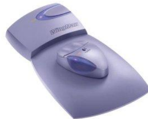
Fig. 2. Logitech Wingman force-feedback mouse [14]

Blind users have the choice of using the keyboard, or using both the keyboard and the Logitech Wingman force-feedback mouse (Figure 2) to interact with the game. The interface contains four different-colored buttons (labeled ‘red,’ ‘blue,’ ‘green’ or ‘orange’) arranged in the shape of a cross. Each button is mapped to an earcon or speech icon, which is presented for a period of 100ms at 60dB using recommendations from [5] (Table 1). The buttons were recreated in the auditory domain using non-speech sound by manipulating the pitch and spatial position of a pure sine tone. Upward movements are indicated by a 1 second sine tone with an upward frequency glissando (220Hz-880Hz) and a sine tone with a downward glissando indicates a downward movement (880Hz-220Hz). Left and right positions were implemented by adjusting the spatial position of a 1 second sine tone (440Hz) earcon accordingly. Haptic spring effects were developed and integrated with the interface to provide guidance towards a target (button labeled ‘red,’ ‘blue,’ ‘green’ or ‘orange’). For example, to prompt the user to move rightwards, the mouse gently guides the users’ hand towards the right-hand side of the page.