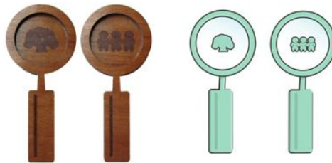
Fig. 2. Tangible (left) and multi-touch (right) magnifying glass tools.

environmental layer, the colour red indicates areas of high damage caused by resources located in those areas. In the population layer, dark pink indicates areas where resources are not efficiently supporting the population.