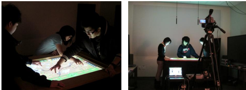
Fig. 4. Playing Futura in groups of three (left). The setup of the user study, showing the Futura game tabletop, three players, microphones, video camera and a additional screen (right).

The mixed methods study design involved collecting data about demographics, game performance, tool use behaviors, player opinions, as well as observations of interaction and play patterns. Quantitative measures included game performance, game scores, and tool use. Tool use data was analyzed for both frequency of occurrence and temporal patterns of usage. In the questionnaire, we asked about learning outcomes, collaboration and tools use. For example we asked the participants if they used the magnifying glasses (TUI and MT) to play the game and if they collaborated with others. We also asked participants if they thought the physicality of the tools made a difference. We used both open and closed questions, the latter ranked with a 7-point Likert scale. We analyzed numeric data with Wilcoxon test to compare the difference of two means, since the data involved repeated measures and included non-Normal count data and ordinal Likert ratings.