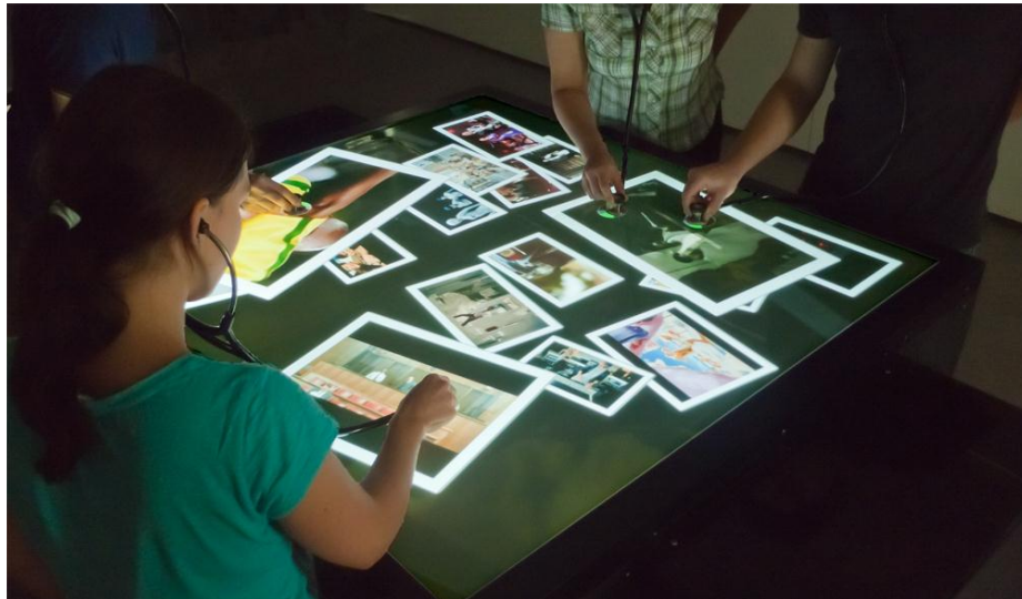
Fig. 2. Multiple users accessing individual auditory content.

Multi-user applications. The described applications easily scale with multiple simultaneous users. Each user is then presented his/her private audio channel depending on the position of his/her stethoscope head identified by his/her own unique visual marker (Fig. 2). Users can listen in to other users' content easily by placing the head of their stethoscope next to that of another user.