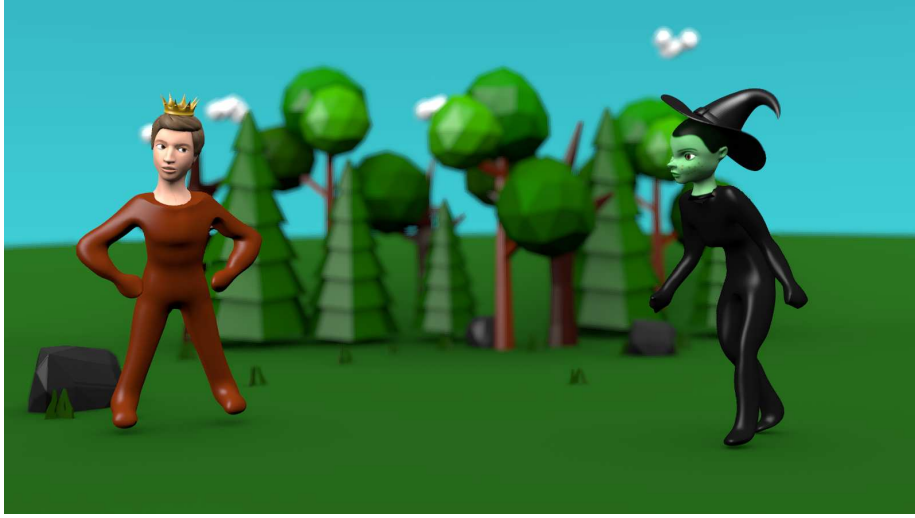
Figure 6: 3D rendering example generated from a recorded session of a make-believe game.

the 3D path reconstruction from the recordings. In our case it is not an issue, as artistic corrections can also be done to improve expressiveness in the final rendering like accentuating some moves or expressions for instance.