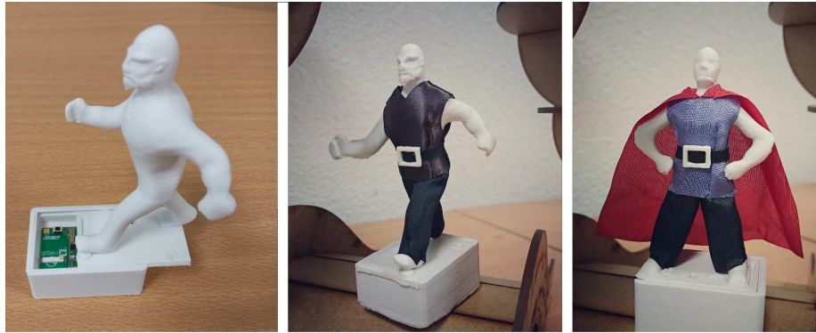
Figure 4: Figurine examples. Left, the IMU in the basement of the soldier figurine. Center and right, the soldier and prince dressed figurines respectively.

IMUs demonstrated that even a 50Hz frame rate is not reliable enough to reconstruct 3D path because of acceleration information sparsity and drift. Among professional available IMUs, we selected the 10-degrees-of-freedom Hikob Fox IMU 1 . This choice was driven by several technical aspects. These sensors are very light (~20 gr with their embedded battery, memory card and printed basement). They are able to record gyroscope, accelerometer and magnetometer data at high frame rate (up to 200Hz) on their memory card. Their storage and their rechargeable battery allow an autonomy of several hours. Last crucial point, using wireless synchronization, all IMUs share a common time reference. For decor elements, everything that fit the playing area can be used and tracked by the framework. In our prototype, we designed decor objects with a laser cutter (see figure 2). These decor elements fit perfectly with the figurines, as their scale has been chosen accordingly.