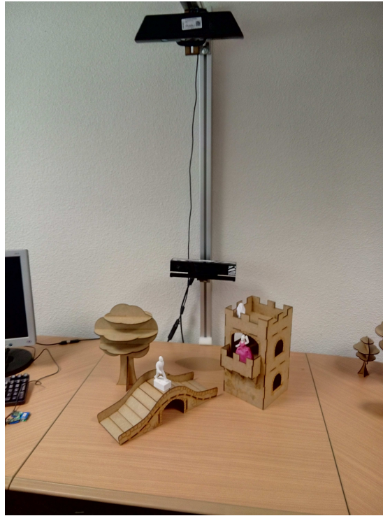
Figure 2: Acquisition setup. There are two Kinect devices: one looking down to follow figurines, one following narrators. The playground area is the table in the middle. Its size in our experiment is 70cm x 70cm.

frame rate is 200Hz. Moreover, real time processing would cause a limited choice for computer vision algorithms used in the framework. As on-line processing is not mandatory for the storyteller, and would not improve the session, it is not a constraint in the framework.