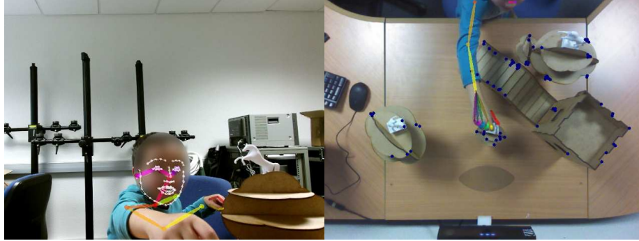
Figure 1: View from a storytelling session with a 6-year old child using the Figurines framework. At left, the frontal view with body and face detections (eyes, ears, nose, neck, shoulders, arms, hands) and facial landmarks of the storyteller using OpenPose [1]. At right, top view with body and hand detection, and decor tracking (blue points). Tracking of figurines is done using a hybrid IMU/RGB-D approach.

around the world, and they always played an important role in human society [2]. Narrative is widely considered to be a fundamental part of human cognition and understanding [3]. Today, storytelling is increasingly performed digitally and it is becoming easier to create stories using available digital technologies [4]. Storytelling is especially important for children education by supporting and enhancing creative expression and learning, as well as encouraging team work and sharing of personal experience [5, 6, 7].