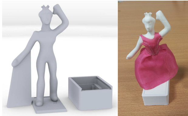
Figure 3: At left, 3D models used to print an enhanced princess figurine. At right, the result dressed figurine.