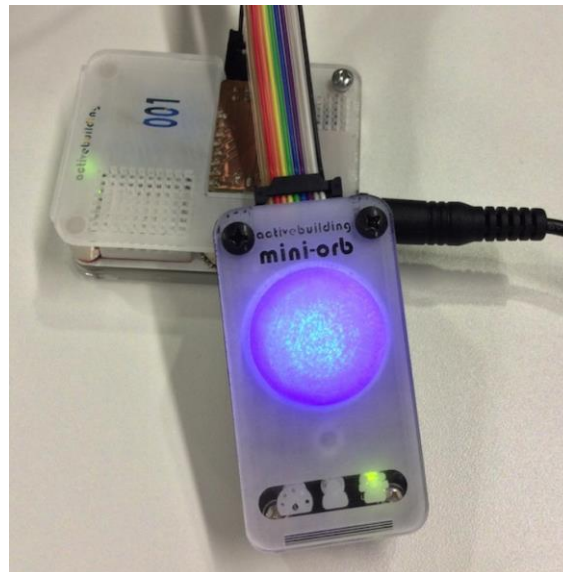
Fig. 1. MiniOrb sensor platform (background) and ambient interaction device (foreground)

The MiniOrb device is an ambient and tangible interaction device that records user's office comfort preference values, displays both sensor reading from the user's local sensor platform, as well as average comfort preferences across all users (see Fig. 1 , foreground). The device consists of three small LED's that indicate different states, a piezo speaker, a button and a scroll-wheel potentiometer for user input, as well as a dome-shaped "orb", a 3D-printed plastic light diffuser which contains a bright RGB-LED and a laser-etched/cut cover.